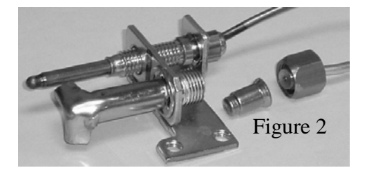
Robertshaw Pilot Assembly