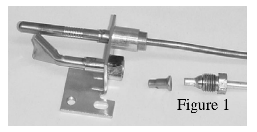
White Rogers Pilot Assembly