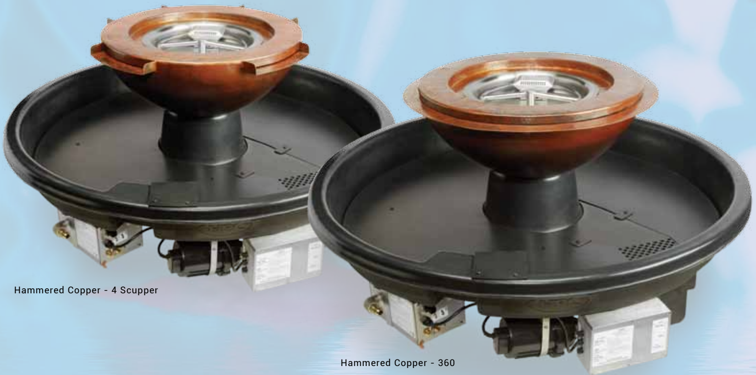
Hammered Copper - 4 Scupper

independently of each other making them ideal in areas that require the water feature to be winterize. Ships in crate on pallet.