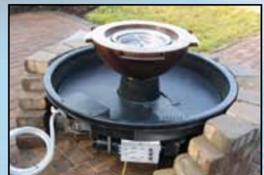
360 Feature being finished with paver stone Includes Basin, 26" Copper Water Bowl, and Electronic Ignition Fire Pit (13SSEI).