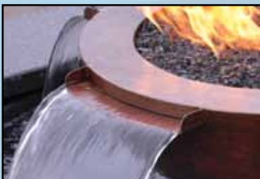
Four Scupper Feature